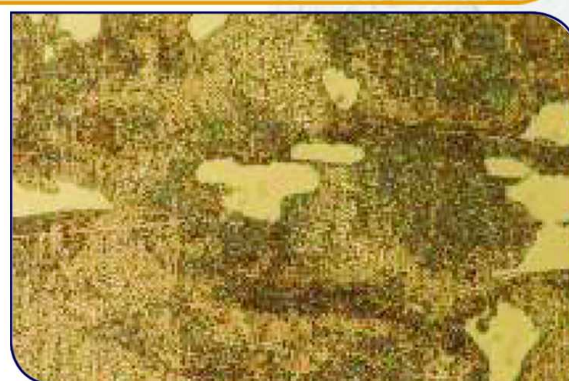
P54N-Pearlitic Matrix with Carbides (x500)