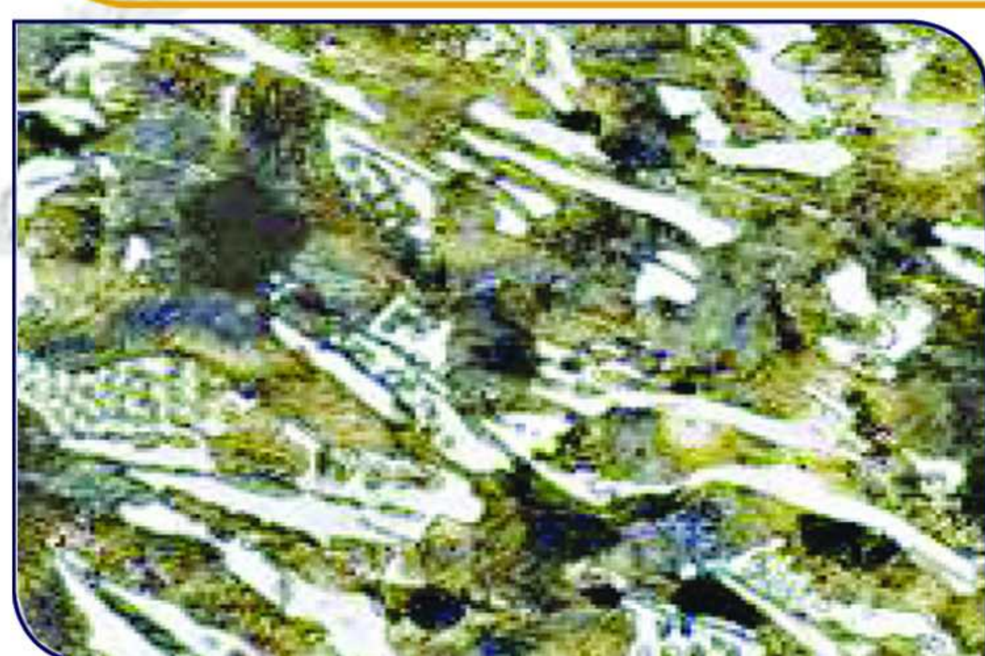
P54N-Pearlitic Matrix with Carbides and Nodular Graphite(x100)